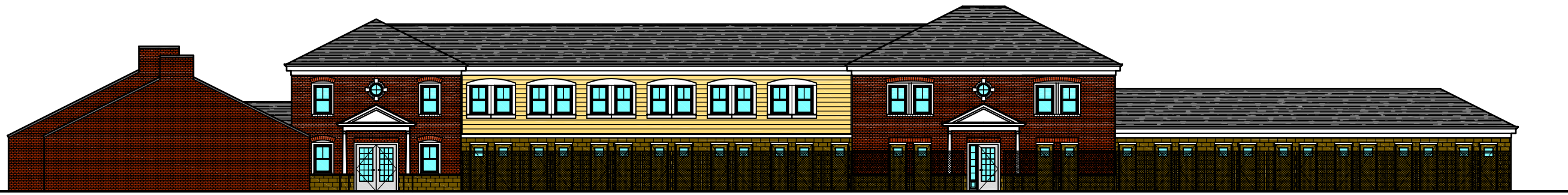
04 SIDE ELEVATION (FROM CHALKLEY ROAD) SCALE: 1/8"=1'-0"