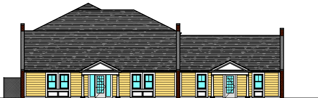
02 FRONT ELEVATION (FROM RT. 10) SCALE: 1/8"=1'-0"