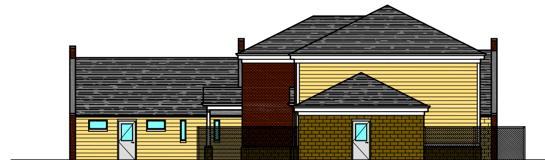
01 REAR ELEVATION SCALE: 1/8"=1'-0"

1627 Westbrook Avenue Richmond VA 23227 t & f . 804.264.1729 www.ratiostudio.com